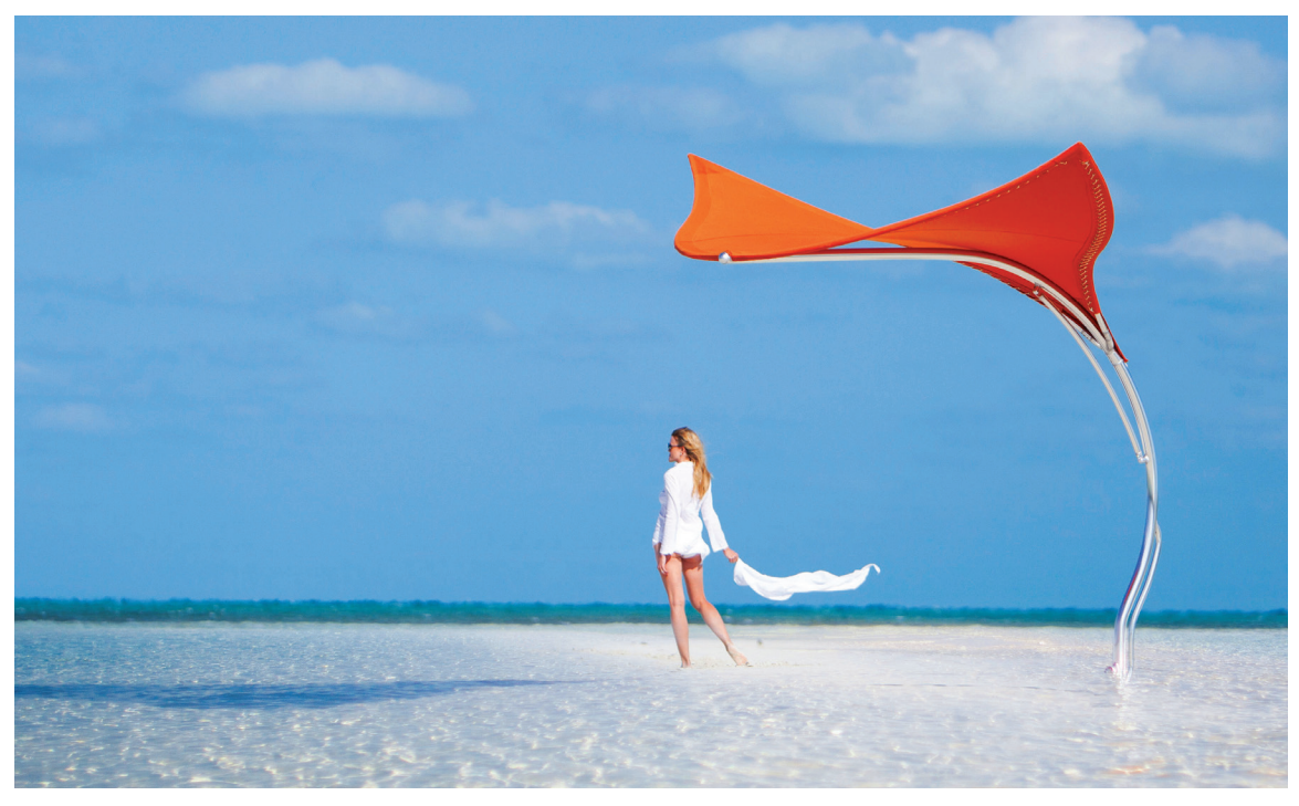
NOTE: minimum 600 lbs anchor required or in-ground installation recommended.

"Design-in-motion" best describes this TUUCI's shade innovation. An expansive wing to wing birth of shade puts the Stingray in a class of its own. With a blend of elements from the natural world and state-of-the-art marine-grade materials, the Stingray is both distinctive and durable. Rotating 360 degrees around its vertical axis, the sculpture can position itself for shade at any time of the day. From the smallest detail of its intricately laced, tensile shade skin to the polished, wrought aluminum armor-wall mast, the Stingray is built for years of blissful and inspired shade luxury.